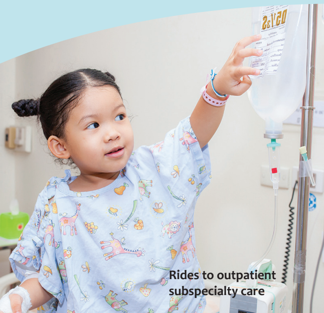
Rides to outpatient subspecialty care

There is no charge for rides provided by The Davies Project; we are here to support your family.