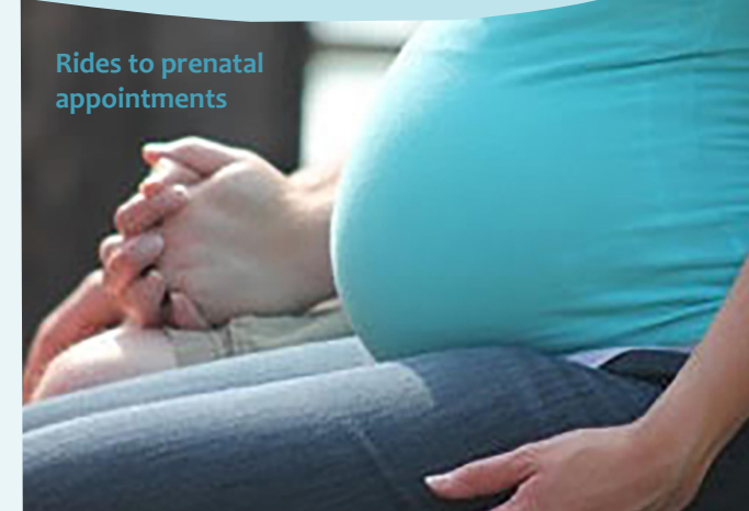
Rides to prenatal appointments

Keeping all your appointments means fewer visits to the emergency department, fewer hospitalizations, and better long-term health outcomes for your child.